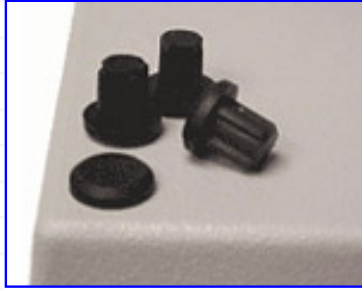
Non-Skid Feet (P/N 50)